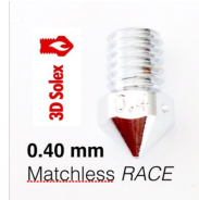
0.40 mm Matchless RACE

SKU: N/A Price: € 14,00 Categories: UM2 Nozzles , UM2 Nozzles