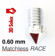
0.60 mm Matchless RACE