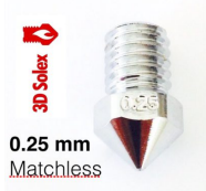
0.25 mm Matchless