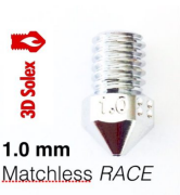
1.0 mm Matchless RACE