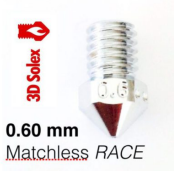
0.60 mm Matchless RACE