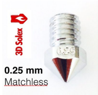
0.25 mm Matchless