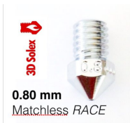
0.80 mm Matchless RACE

SKU: N/A Price: € 69,00 - € 74,00 Categories: Ultimaker 2 , UM2 Nozzles , Everlast , UM2 Nozzles