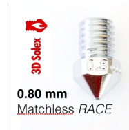
0.80 mm Matchless RACE

Categories: UM2 Nozzles , Nozzles , UM2 Nozzles