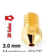
2.0 mm Matchless RACE