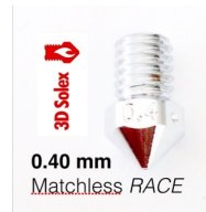
0.40 mm Matchless RACE