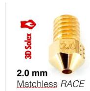
2.0 mm Matchless RACE